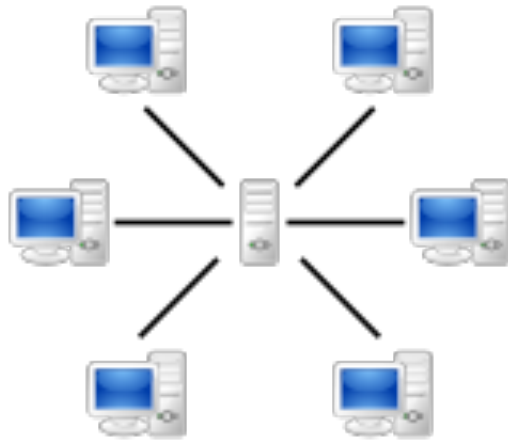
Traditional Client / Server